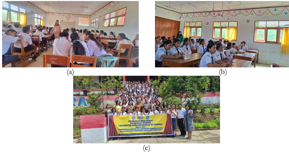
Figure 3. Socialization to Build Students' Character and Communication Skills with Management, Legal Knowledge, and Environment Approaches in Education

questionnaires and direct observation of changes in student behavior. The evaluation results showed that: a) 89% of students felt more confident in communicating after participating in this activity, and b) 85% of students showed a better understanding of positive and legal characters, as well as how to apply them in everyday life. Some documentation of service activities carried out by lecturers of Sisingamangaraja XII Tapanuli University in collaboration is as follows: